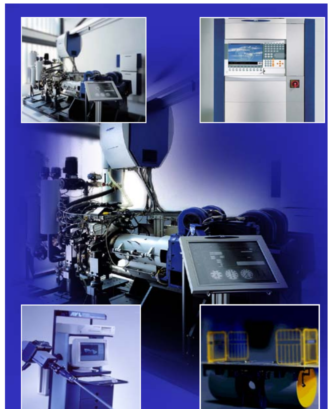
Figure 1: The PUMA Open Instrumentation and Test System for Engines, Transmissions and Power Trains

PUMA Open is an automation system (AS) (Figure 1) for the development and test of engines, transmissions and power trains. PUMA Open has been designed as an open platform in the sense that it is based on standardized interfaces for data acquisition and communication as well as modular hardware and software components. This supports the extension and configuration of the AS.